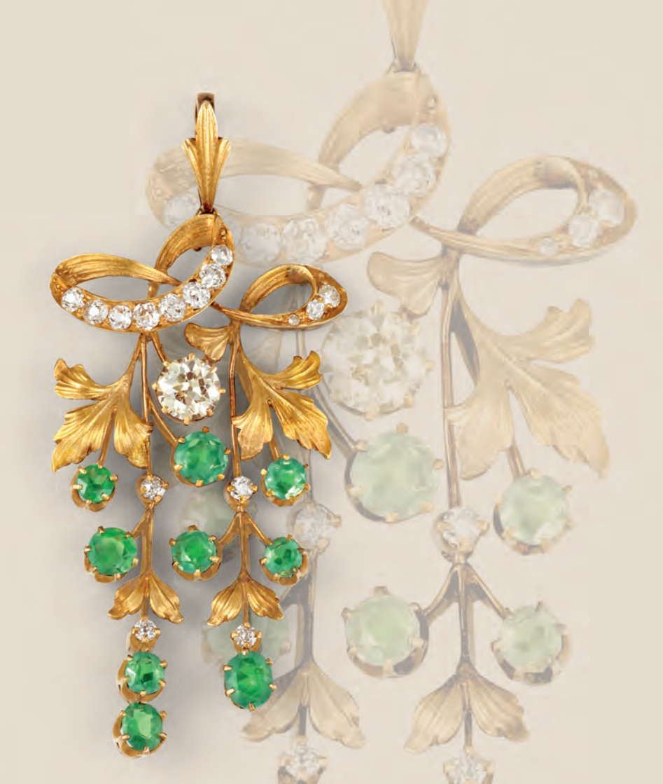
Figure #5 - Antique Russian pendant, circa 1880, set with Demantoid Garnets and diamonds

is that garnets are pretty hard, averaging from 6.5 to 7.5 on the Mohs scale which makes them quite wearable! They belong to the cubic crystal system, but do not have cleavage planes, so they are not fragile, and take well to cutting and a good polish. They are almost always "natural", in that only a very small percentage of garnets are treated or enhanced, which is extremely rare in the gemstone market today. So let me introduce to those of you that are unfamiliar with the beauty of garnet a few examples of this great gemstone.