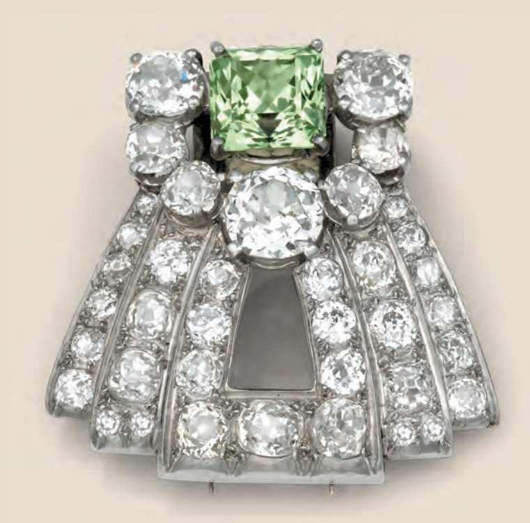
Figure #3 – The new "Mint" Garnet, this stone, weighing over 4 carats, very closely resembles a green diamond!

It is always a pleasure to be included in Antiquorum's VOX and to take a few pages to devote to my passion – gems and jewelry. On this occasion, I would like to hopefully enlighten some of you about the exceptionally beautiful, and often highly underrated, species of GARNETS! When the average person thinks about garnets, a cheap, dark red stone usually comes to mind, often associated with rather common Victorian jewelry, and sadly associated with mourning jewelry. But alas, there is a whole other world of these gemstones, including bright orange and vivid green garnets that are of significant value and are magnificent both in jewelry and for the collector.