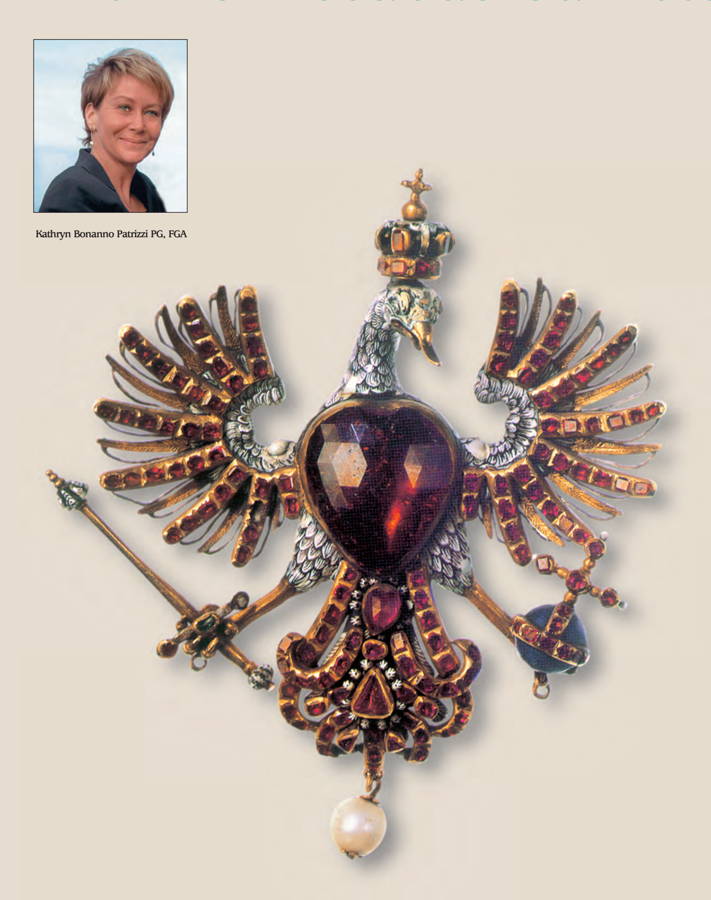
Figure #1- "Hyacinth" Garnet, (an archaic term used to describe a pyrope-almandine type Garnet), mounted with small rubies, in the "Eagle of Poland",

made in Germany. The jewel was part of the collection of the Royal Crown Jewels of Louis XIV, now housed in the Louvre in Paris.