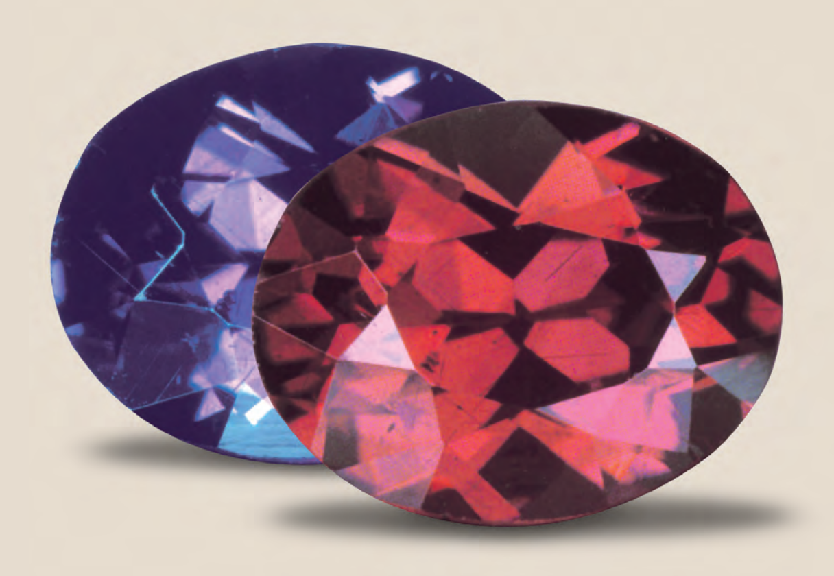
Figure #7 - An extremely rare Color-Change Garnet from Madagascar

established, but I bought a lovely specimen for several hundred dollars per carat!