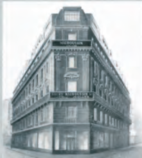
MAUBOUSSIN JOAILLERIE DIAMANTS ET PIERRES PRÉCIEUSES 3 RUE DE CHOISEUL PARIS NEW-YORK BUENOS-AYRES RIO-DE-JANEIRO

As evidenced by the three thematic exhibitions, Mauboussin had a great love of fine gems and paid homage to them. This is important to keep in mind when discussing fine Art Deco jewelry. It is the first great era for gems. In past centuries, fine jewels were made in yellow gold or silver, the mountings playing a prominent role in relationship to the stones; most of these jewels were rather heavy and stiff, with much metal showing. The Art Nouveau period (circa 1890 – 1915) was devoted to the naturalistic approach, using “poor” materials such as horn, glass, silver, and common gem materials, and while there were beautifully crafted jewels, the whole movement was devoted to